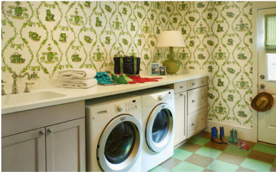
The page features a kitchen with a patterned wallpaper, a white countertop, a white washing machine and a white dryer. The room is bright and airy, with a white door and a window with a striped curtain. A hat hangs on the door. Next Page: A main floor popcorn bucket storage area, a main floor popcorn bucket storage area, a main floor popcorn bucket storage area, a main floor popcorn bucket storage area.