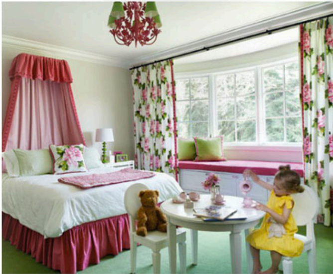
This page: Designer Sarah Clark took the garden and garden landscape as her inspiration for this room, and used fabric and color to bring to life the garden. The pink and white color palette was inspired by the garden, and the green and white accents were inspired by the garden. The pink and white color palette was inspired by the garden, and the green and white accents were inspired by the garden. Next Page: The Look at Modern Classic Style Bathroom. The bathroom features a white pedestal sink, a white toilet, and a white bathtub. The walls are covered in a vibrant orange and white patterned wallpaper. The floor is covered in a white and black checkered tile. The room is bright and cheerful, with a large window and a round mirror.